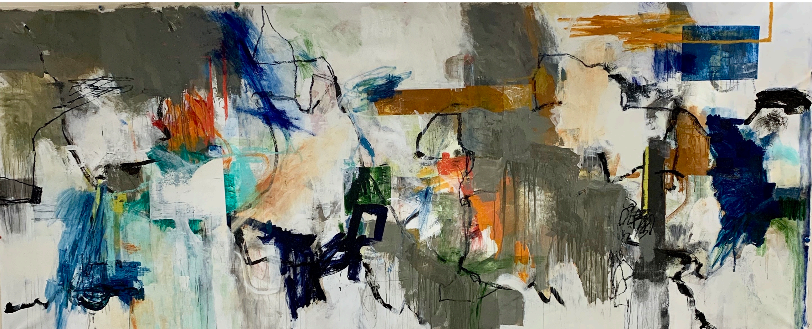
Cigars on the Beach # 66" x 108"